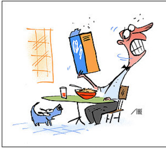
(Bob Staake for The Washington Post)

The examples explain it all -- or should. This week: Alter the name of a food or dish slightly and describe the result, as in the examples above by 74-time Loser Christopher Lamora, who suggested this contest. (He wins a mini-tube of cola-flavored toothpaste.) By "alter slightly," we mean not so much that a non-imbecile can't figure out what the original term was.